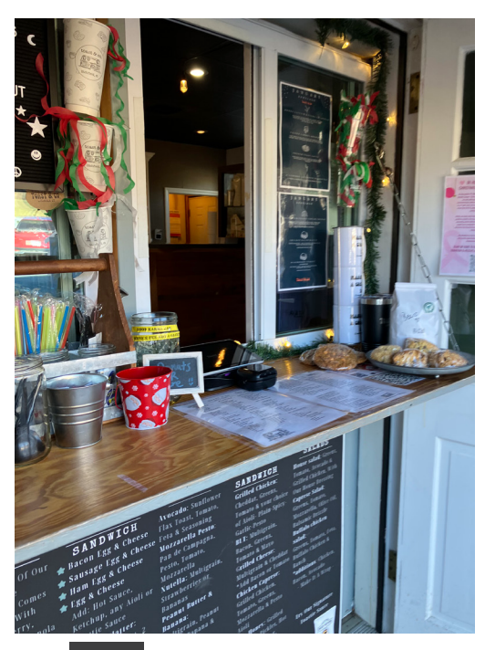
TOAST & CO, ORDERING WINDOW, 2023.