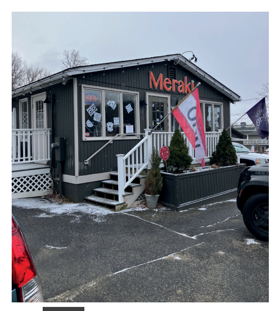
MERAKI, OUTSIDE APPEARANCE, 2023.