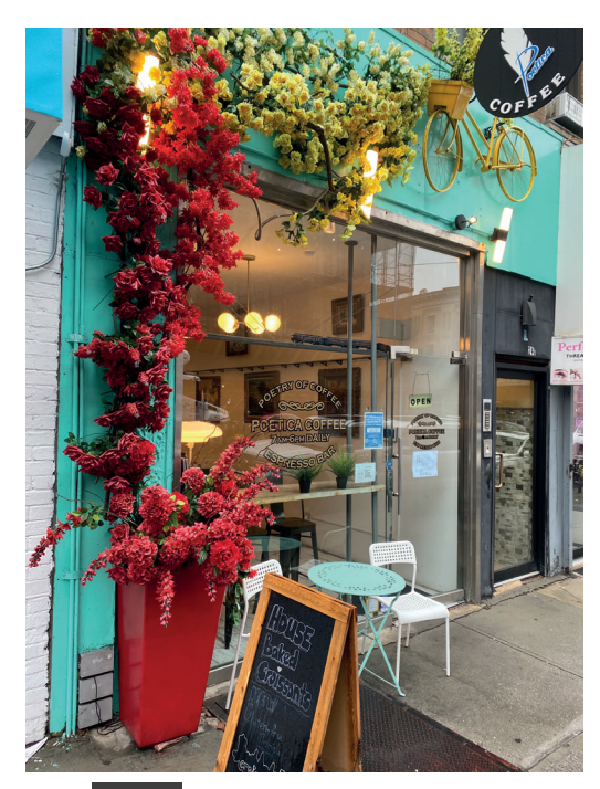
FIG. 8. POETICA, OUTSIDE APPEARANCE, 2023.

It is easy to see how upscale coffee shops in very urban Park Slope are not only visually similar to each other as to the Taste of Luxury, but, as will be shown later in this essay, to those in very rural Litchfield, Connecticut.