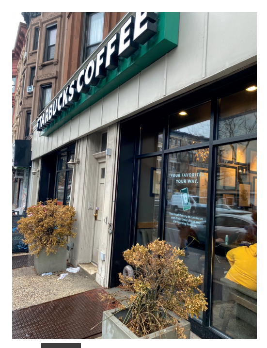
Starbucks, Outside Appearance, 2023.