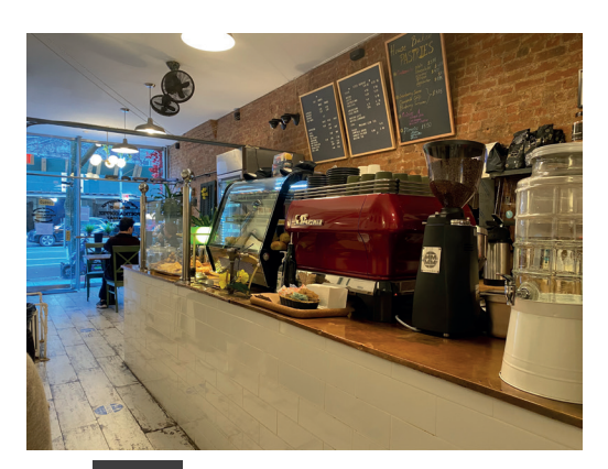
FIG. 9. POETICA INSIDE APPEARANCE, 2023.