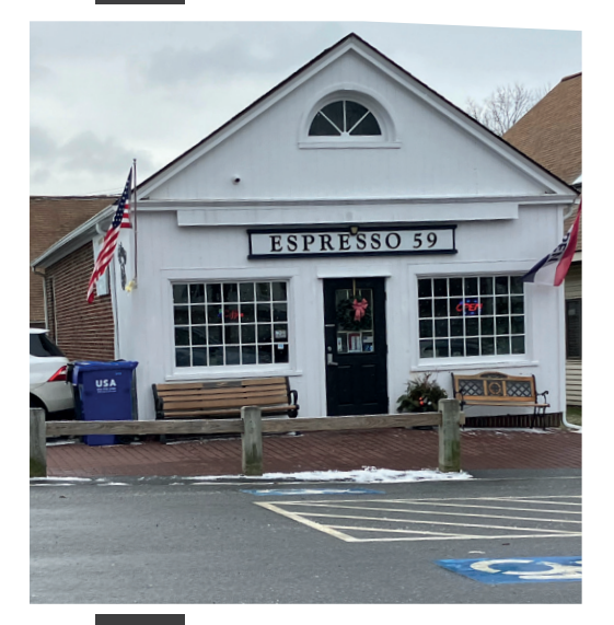
ESPRESSO59, OUTSIDE APPEARANCE, 2023.