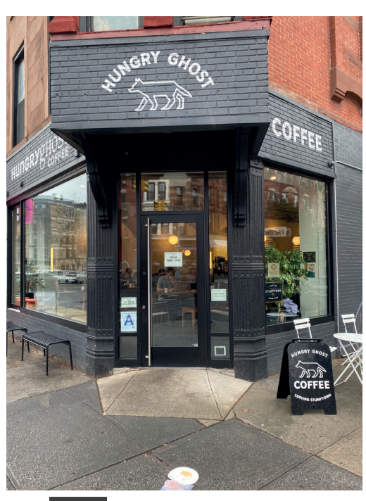
Hungry Ghost, Outside Appearance, 2023.