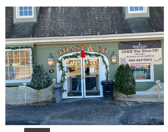
TOAST & CO, OUTSIDE APPEARANCE, 2023.