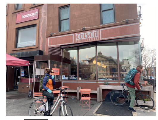
FIG. 10. COLSON PATISSERIE OUTSIDE APPEAR-ANCE, 2023.