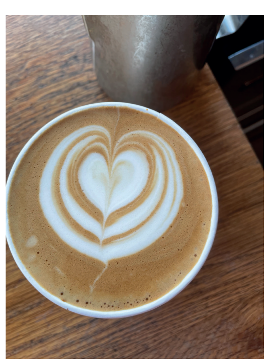
FIG. 12. LEANDER LETIZIA'S BARISTA SIGNATURE 2023.