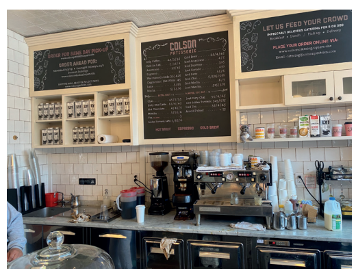
COLSON PATISSERIE INSIDE APPEARANCE, 2023.