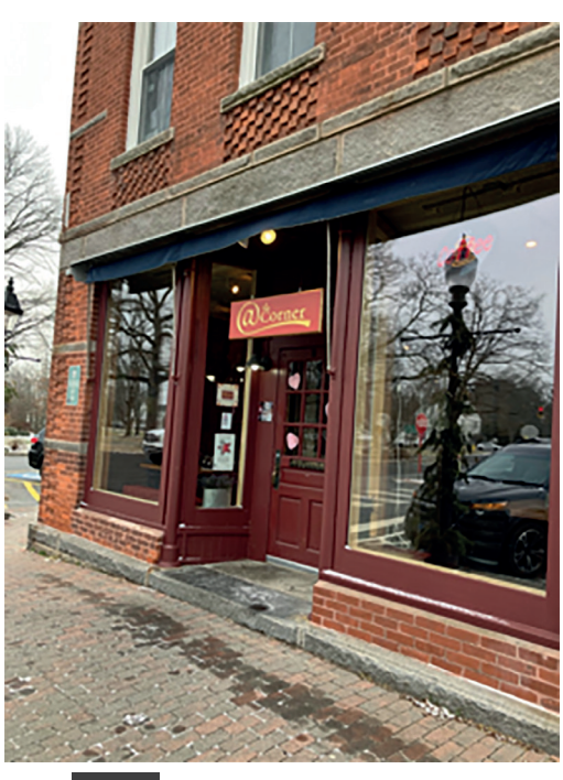
AT THE CORNER, OUTSIDE APPEARANCE. 2023.