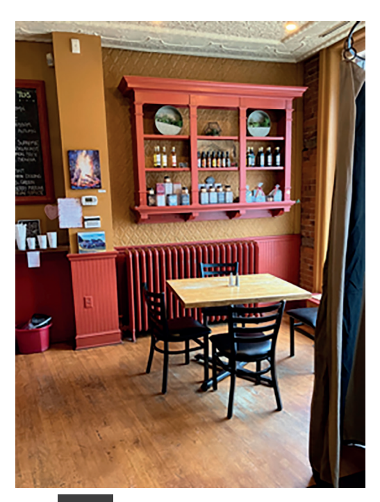
AT THE CORNER, INSIDE APPEARANCE, 2023.