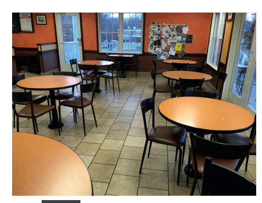
FIG. 20. DUNKIN' DONUTS, INSIDE APPEARANCE, 2022.