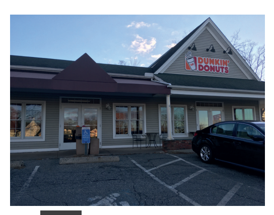
FIG. 19. DUNKIN' DONUTS, OUTSIDE APPEARANCE, 2022.

tions earlier than New York State on May 20, 2020. Prior to the reopening, large clear plexiglass shields were hung across all the once open counter spaces. After the gradual reopening, no sitting inside was allowed and masking was required for both staff and customers at Dunkin' Donuts. (See Figure 24) However, many of the Pandemic-skeptical customers did not comply with the mask mandate, and due to their familiarity, if not agreement with their skepticism, with them the staff did not scold them. When sitting inside was allowed, tables were spaced more widely and I couldn't hand my cup to a worker to fill my cup until summer 2022 when pandemic restrictions ended.